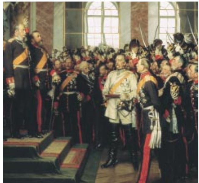
THE UNIFICATION OF GERMANY. Under Prussian leadership, a new German Empire was proclaimed on January 18, 1871, in the Hall of Mirrors in the palace at Versailles. King William of Prussia became Emperor William I of the Second German Empire. In this painting by Anton von Werner, Otto von Bismarck, the man who had been so instrumental in creating the new German state, is shown, resplendently attired in his white uniform, standing at the foot of the throne.

After a successful revolution had deposed Queen Isabella II, the throne of Spain was offered to Prince Leopold of Hohenzollern-Sigmaringen, a distant relative of the Hohenzollern king of Prussia. Bismarck welcomed this possibility for the same reason that the French objected to it. If Leopold were placed on the throne of Spain, France would be virtually encircled by members of the Hohenzollern dynasty. French objections caused King William I to force his relative to withdraw his candidacy. Bismarck was disappointed with the king's actions, but at this point the French overreached themselves. Not con-